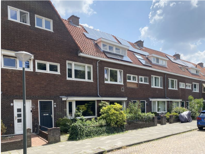
Prinsenhof 5616TE EINDHOVEN Rent per month € 2.250,- excl.