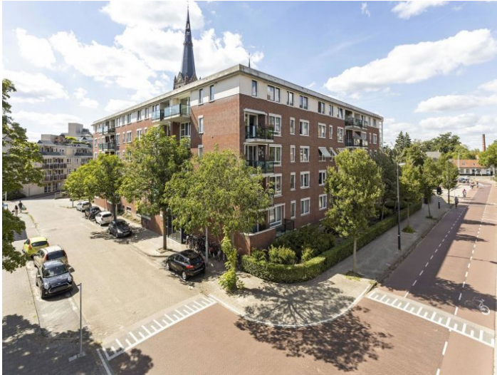
Pastoor Sickingstraat 5614 HV Eindhoven Rent per month € 1.500,- excl.