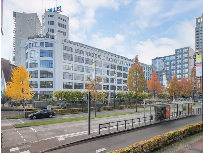
Lichttoren 5611BJ Eindhoven Rent per month € 1.675,- excl.