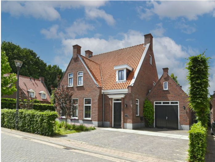
Tierelayshoeve 5708VV Helmond Rent per month € 3.500,- excl.