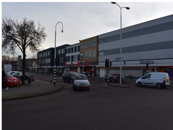
Franz Leharplein 5654 AZ Eindhoven Rent per month € 825,- excl.