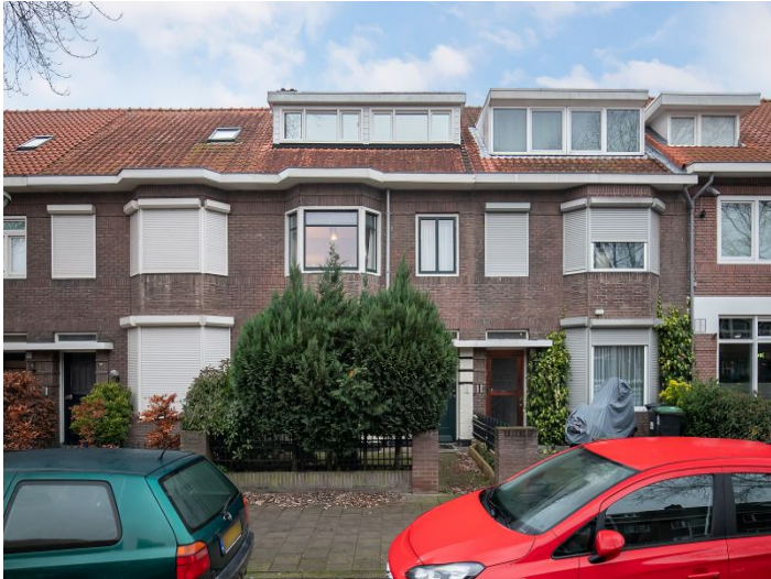
Roostenlaan 5644GE Eindhoven Rent per month € 450.000,- excl.