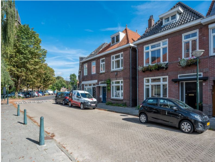
Carmelitessenstraat 5652EW Eindhoven Rent per month € 1.895,- excl.