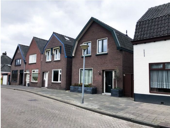
Scheidingstraat 5654AA Eindhoven Rent per month € 1.950,- excl.