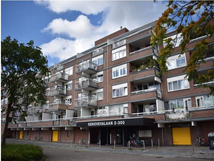
Genovevalaan 5625AJ Eindhoven Rent per month € 1.300,- excl.