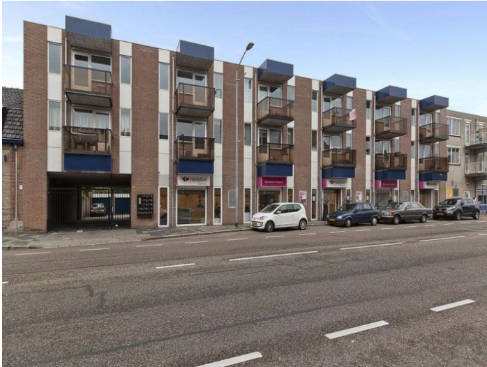
Geldropseweg 5611SG Eindhoven Rent per month € 1.275,- excl.