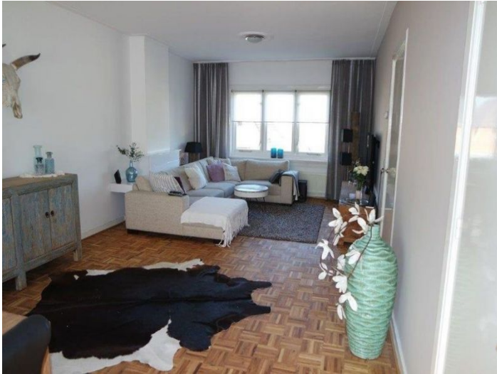
Nicolaas Beetsstraat 5615JH Eindhoven Rent per month € 1.295,- excl.