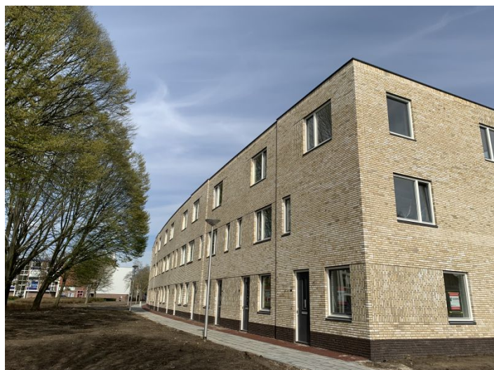
Kees de Beverpad 5622 DZ Eindhoven Rent per month € 1.500,- excl.