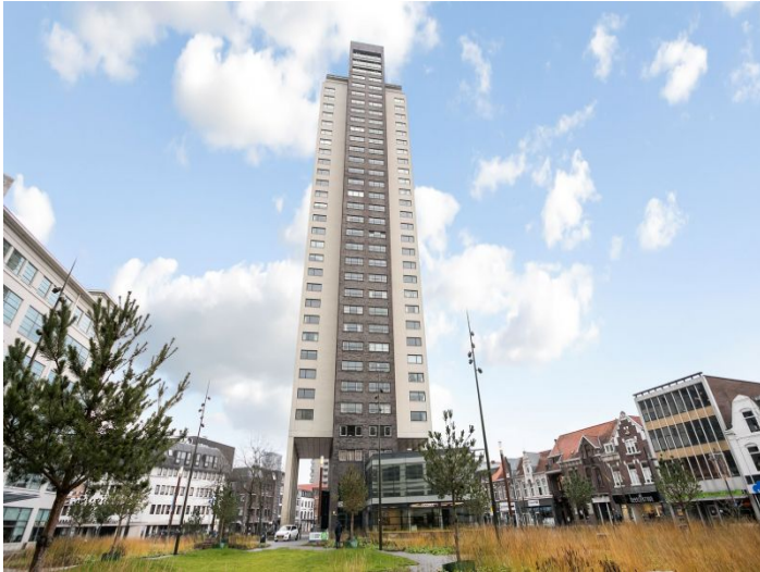
Regent 5611 HW Eindhoven Rent per month € 1.650,- excl.