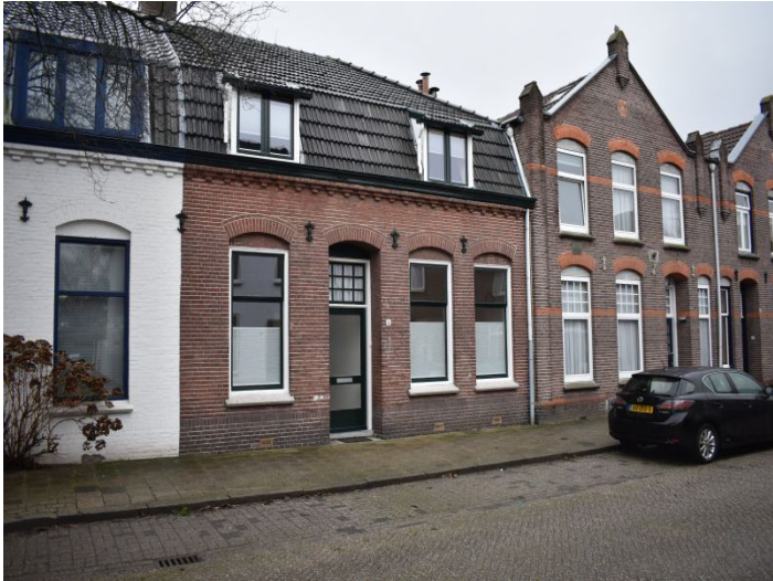
St Martinusstraat 5615 PK Eindhoven Rent per month € 1.650,- excl.