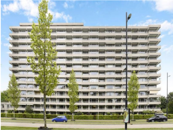
Herman Gorterlaan 5644 SK Eindhoven Rent per month € 525,- excl.