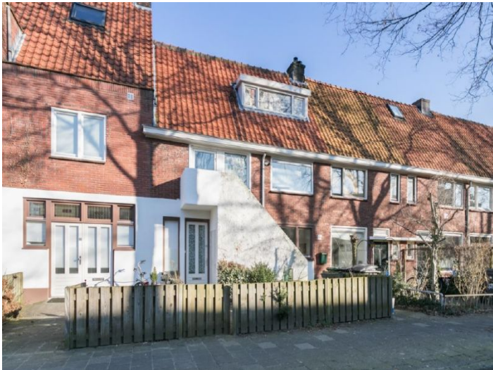
Hortensiastraat 5644KN Eindhoven Rent per month € 1.200,- excl.