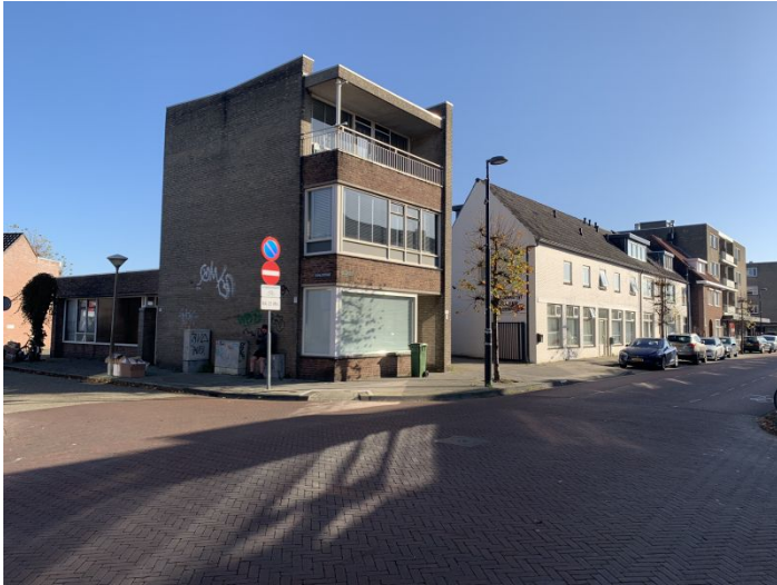
Schalmstraat 5614 AC Eindhoven Rent per month € 895,- excl.