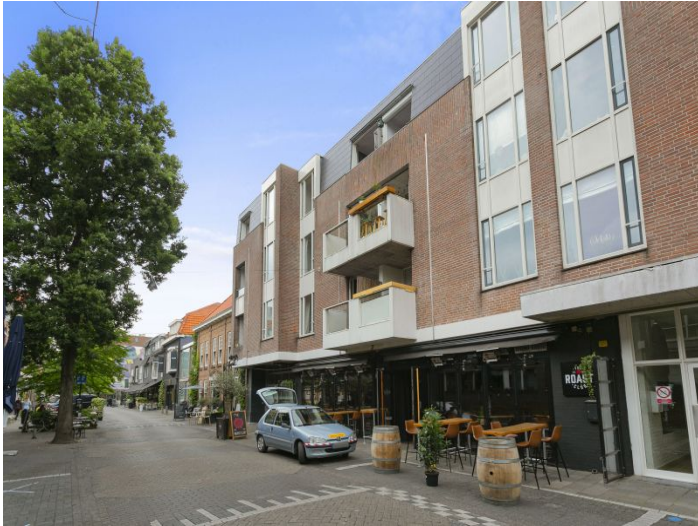
Kleine Berg 5611 JT Eindhoven Rent per month € 1.400,- excl.