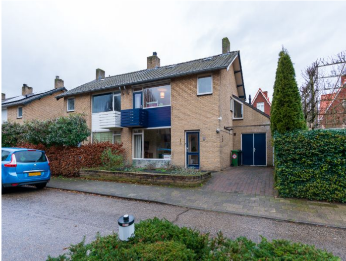
Vincent van Goghlaan 5581 JL Waalre Rent per month € 1.595,- excl.