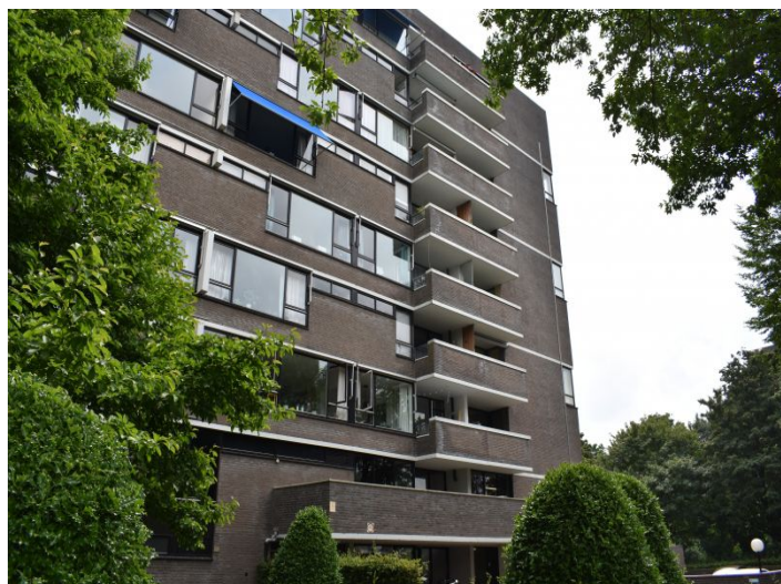
Korfakker 5625SP Eindhoven Rent per month € 1.150,- excl.