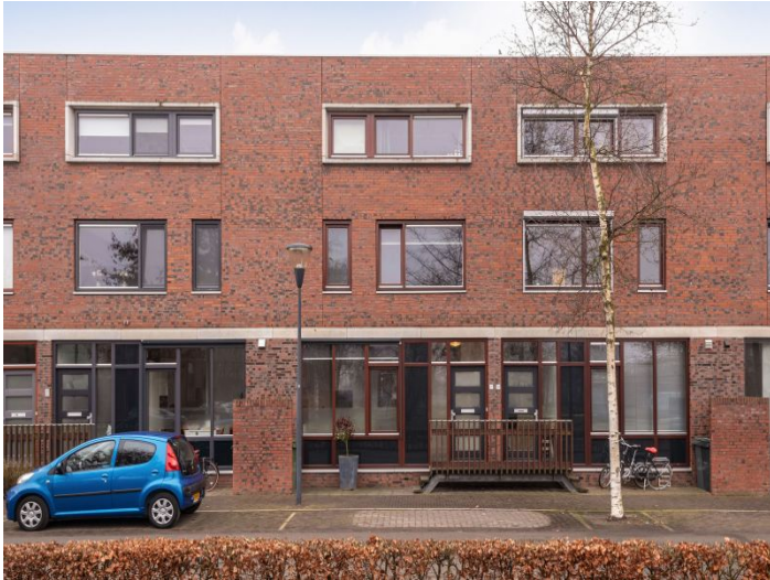
Graspieper 5658 EN Eindhoven Rent per month € 1.900,- excl.