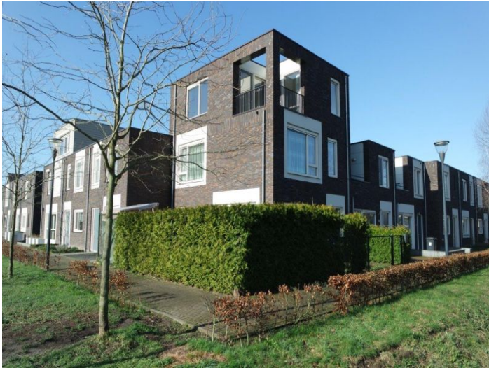
Landleven 5658HZ Eindhoven Rent per month € 1.250,- excl.