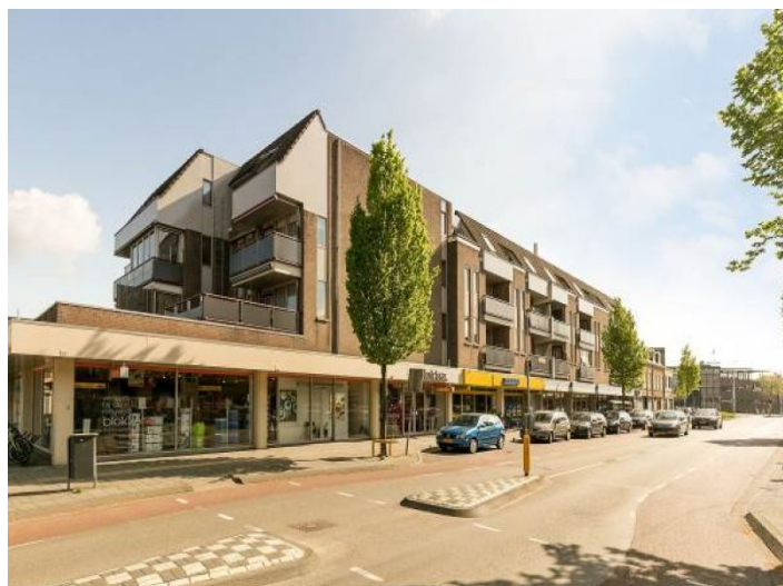
Rietvinkstraat 5613 BX Eindhoven Rent per month € 1.300,- excl.