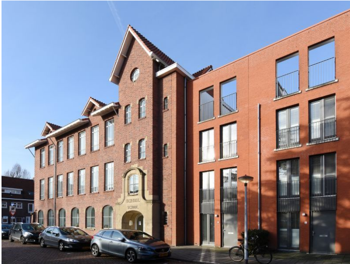
Anna van Egmondstraat 5611 JE Eindhoven Rent per month € 2.500,- excl.