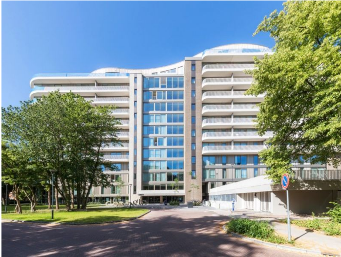
Frederik van Eedenplein 5611KT Eindhoven Rent per month € 1.445,- excl.