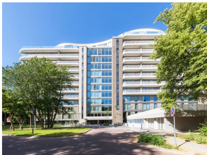
Frederik van Eedenplein 5611KT Eindhoven Rent per month € 1.250,- excl.