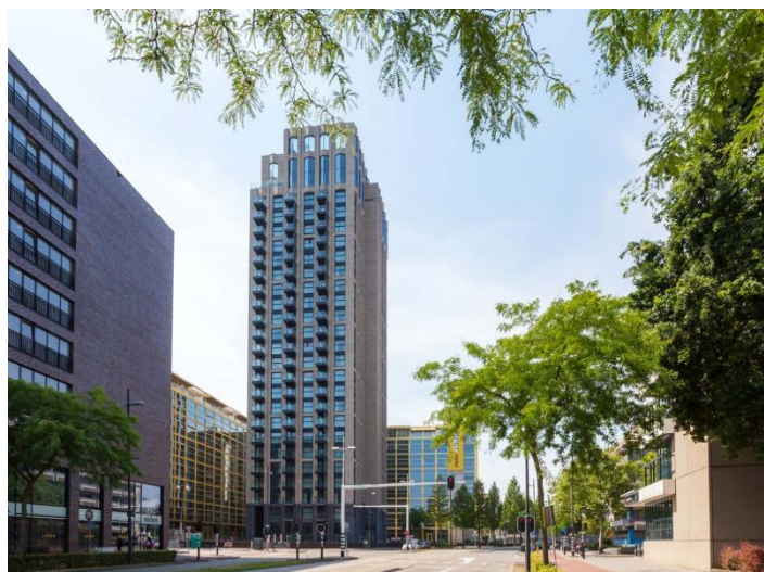
Victoriapark 5611 BM Eindhoven Rent per month € 1.945,- excl.