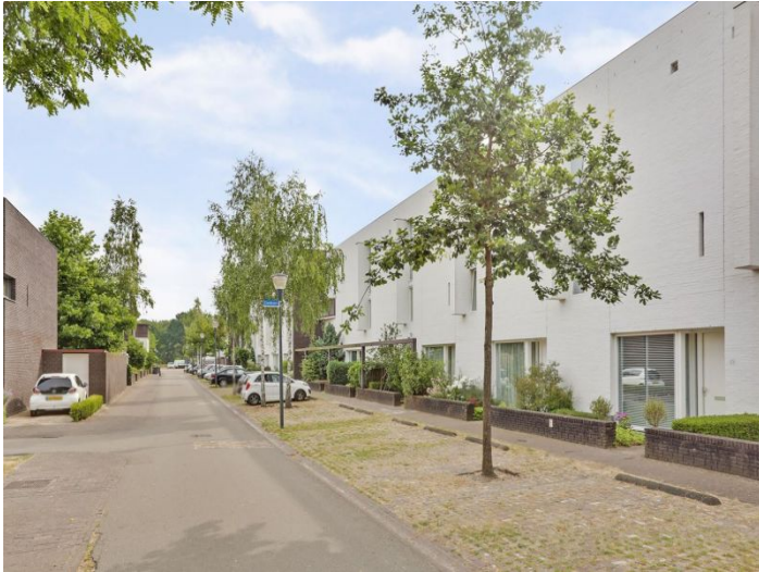
Zandbaars 5658BS Eindhoven Rent per month € 1.800,- excl.