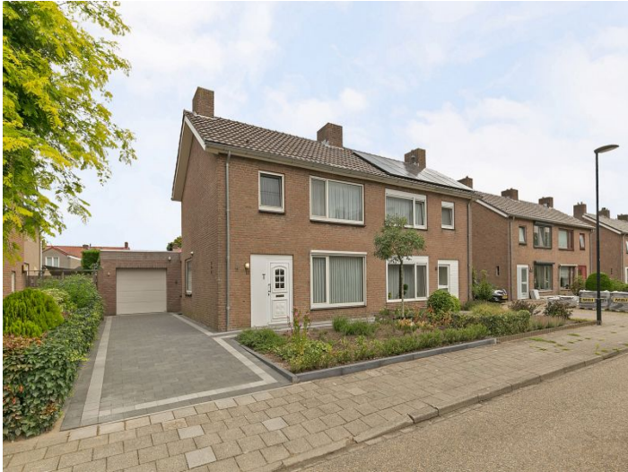
Adelheid van Voornstraat 5721KA Asten Rent per month € 1.375,- excl.