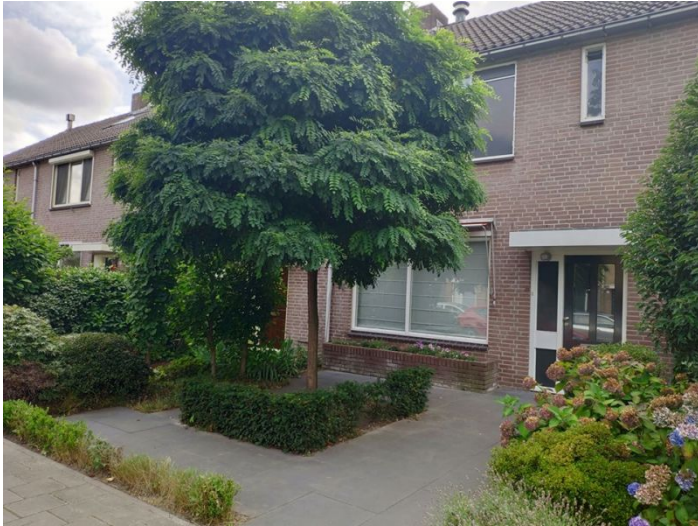
Baarle Hertoglaan 5628 PN Eindhoven Rent per month € 1.600,- excl.