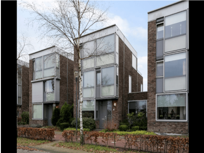
Meerhovendreef 5658 HA Eindhoven Rent per month € 2.500,- excl.