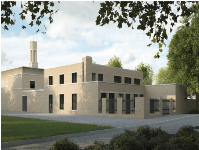
Albertipad 5624 BZ Eindhoven Rent per month € 995,- including energy