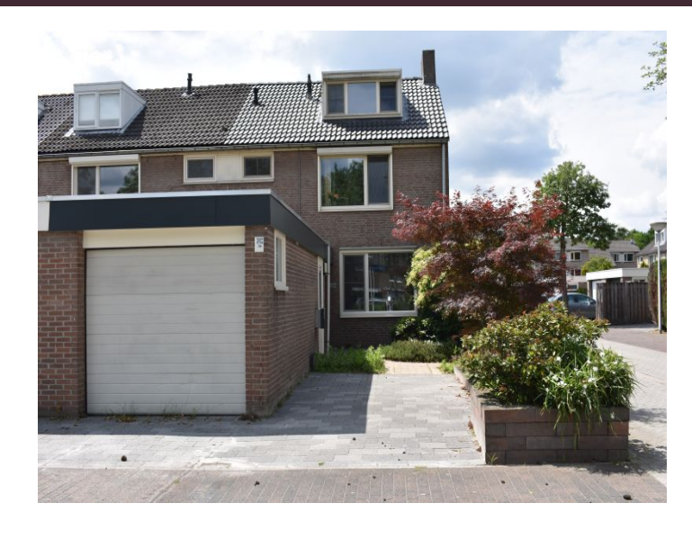
Duinbeek 5653PL Eindhoven