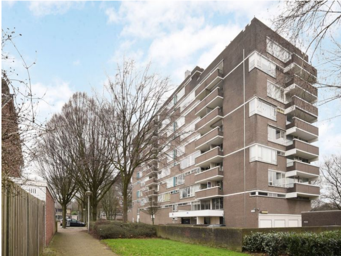
Maalakker 5625SK Eindhoven Rent per month € 1.195,- excl.