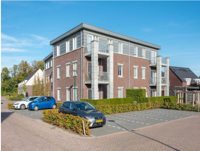
Rijthof 5561 BG Riethoven Rent per month € 850,- excl.