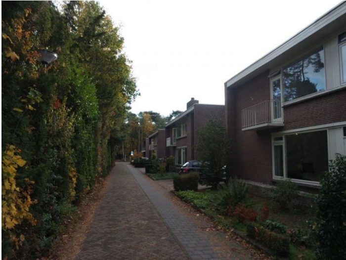
Rubenstraat 5691 EC Son en Breugel Rent per month € 1.595,- excl.