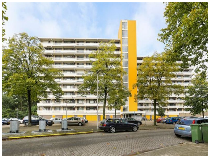
De Koppele 5632LM Eindhoven Rent per month € 975,- excl.