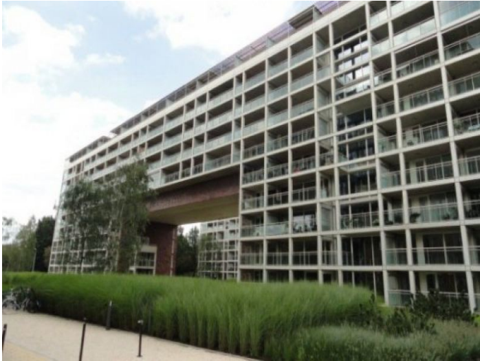
Abdijsgraven 5504 ET Veldhoven Rent per month € 2.100,- excl.