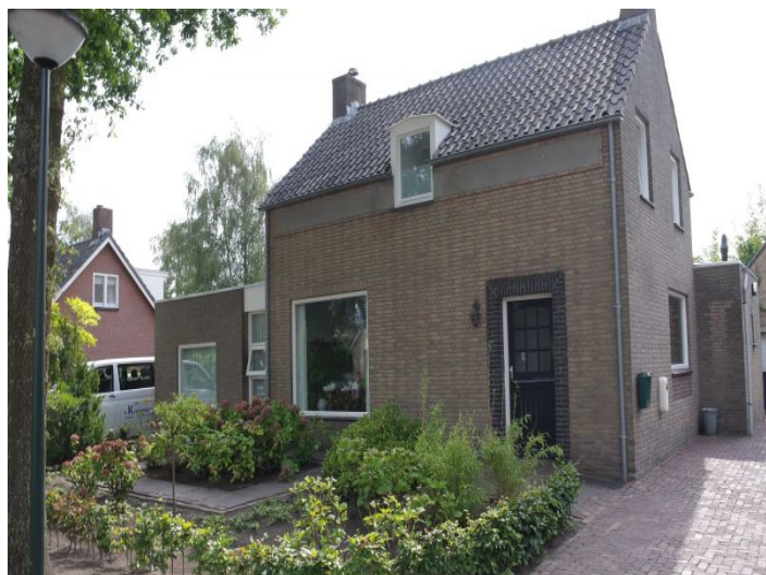
Koestraat 5298 AR Liempde Rent per month € 1.495,- excl.