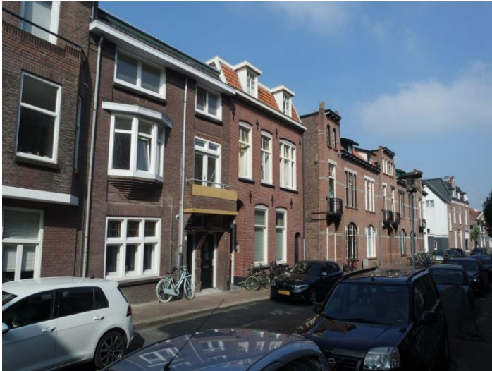
Prins Hendrikstraat 5611 HJ Eindhoven Rent per month € 1.500,- excl.