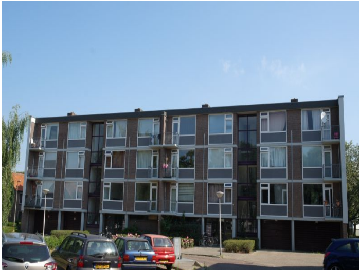
Menno van Coehoornlaan 5622 DE Eindhoven Rent per month € 950,- excl.