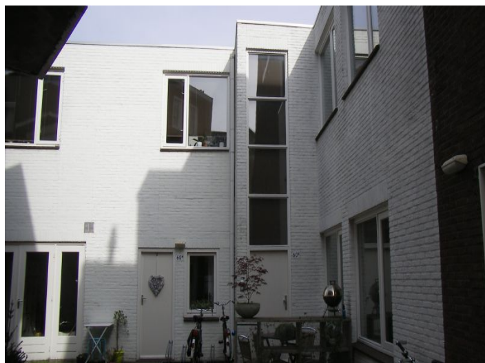
Grote Berg 5611 KL Eindhoven Rent per month € 855,- excl.