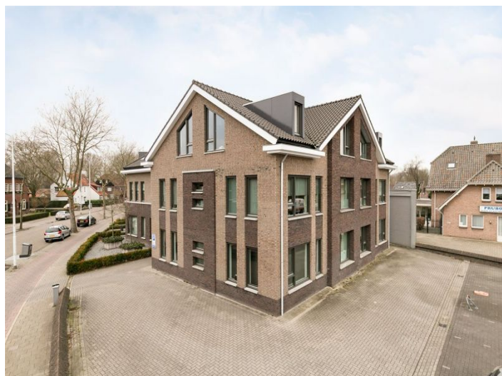
Rijnstraat 5626 AN Eindhoven Rent per month € 990,- excl.