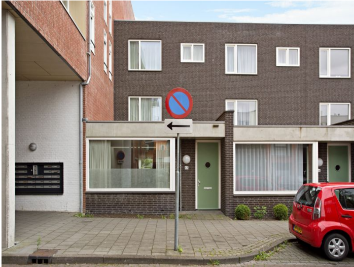
Dommelhofstraat 5613 EM Eindhoven Rent per month € 1.850,- excl.