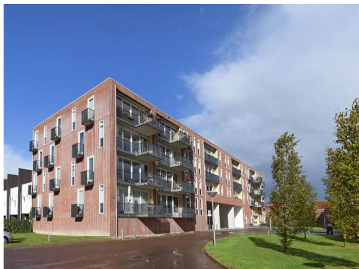
Dommelhofstraat 5613 EX Eindhoven Rent per month € 1.350,- excl.