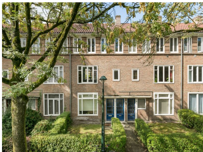
St Nicasiusstraat 5614 CG Eindhoven Rent per month € 1.150,- excl.