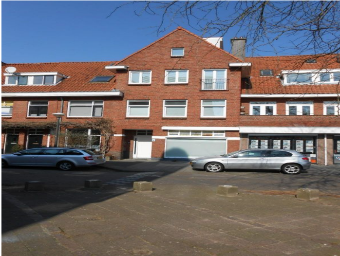
Amalia van Anhaltstraat 5616 BH Eindhoven Rent per month € 1.095,- excl.