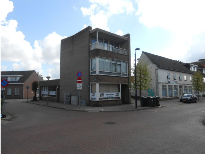
Schalmstraat 5614 AC Eindhoven Rent per month € 775,- excl.