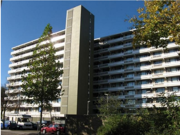
De Koppele 5632 LP Eindhoven Rent per month € 1.000,- excl.