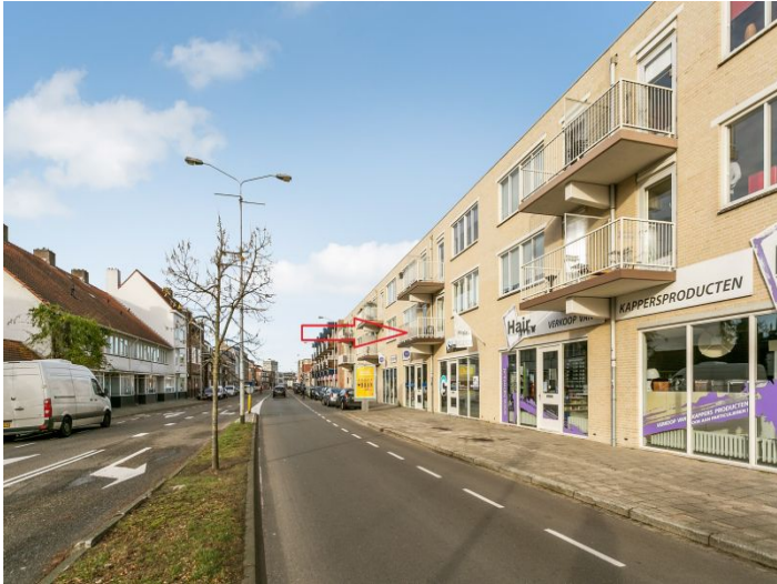
Gabriel Metsulaan 5611 SR Eindhoven Rent per month € 1.450,- excl.